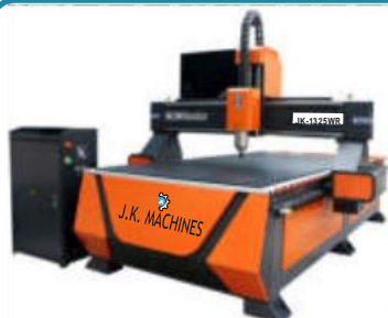
CNC WOOD ROUTER (Pg. No. 17)