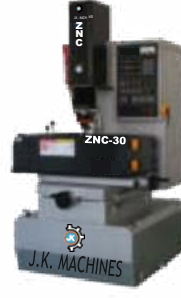
ZNC EDM DC SERVO (Pg. No. 05)