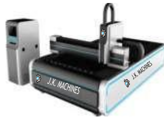
FIBER LASER CUTTING (Pg. No. 13)