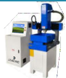
CNC ENGRAVING (Pg. No. 16)