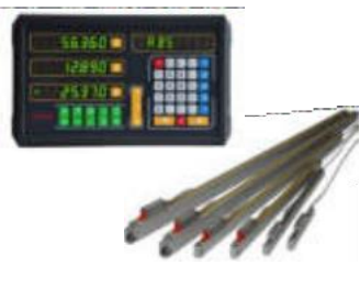
DIGITAL READOUT (Pg. No. 19)