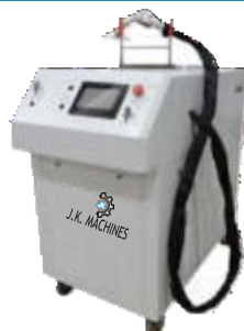
HAND HELD LASER (Pg. No. 12)