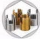
Self Tapping Brass