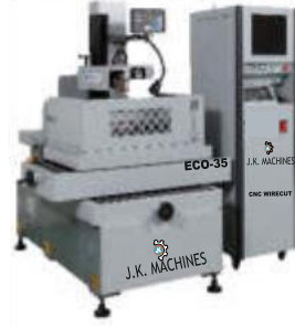
CNC WIRE CUT DC STEPPER (Pg. No. 09)