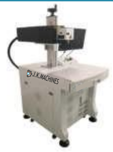
LASER MARKING/ENGRAVING (Pg. No. 14)