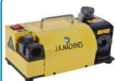
DRILL BIT GRINDER (Pg. No. 18)