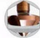
Chamfer of Inner Hole