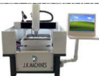
CNC ENGRAVING (Pg. No. 16)