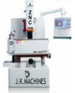
ZNC EDM AC SERVO (Pg. No. 06)