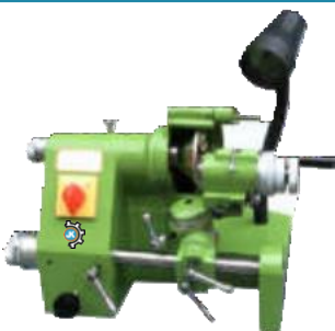
SINGLE LIP GRINDER (Pg. No. 18)