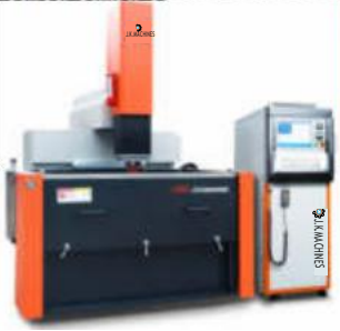
CNC EDM (Pg. No. 03)