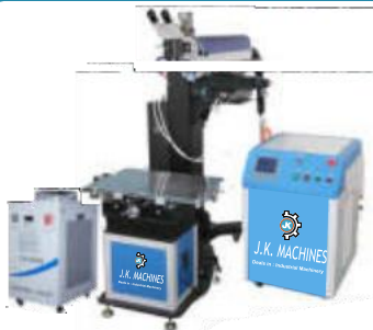
LASER WELDING (Pg. No. 11)