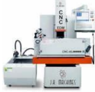
CNC EDM (Pg. No. 04)