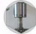
Outer Circular Die