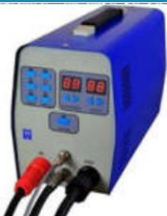
MIRO TIG WELDING (Pg. No. 14)