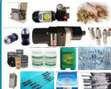
CONSUMABLES/SPARES (Pg. No. 20)