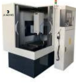
CNC ENGRAVING (Pg. No. 15)