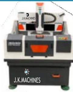
CNC ENGRAVING (Pg. No. 15)