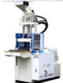
VERTICAL MOULDING (Pg. No. 21)