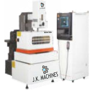
CNC WIRE CUT AC SERVO (Pg. No. 10)