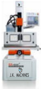
DRILL EDM (Pg. No. 08)