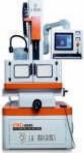
CNC DRILL EDM (Pg. No. 07)